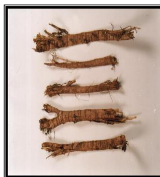
Fig.2: Roots of Bauhinia variegata Linn Plant